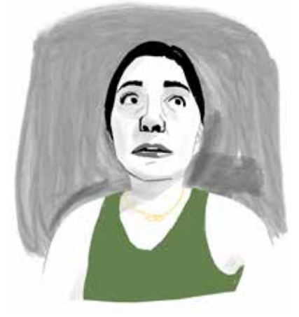
TODAY, 40 MILLION WOMEN AND GIRLS ARE UNDER SURVEILLANCE BY THE COUNTRY'S MORALITY POLICE.

"And the punishment for that is death row. So, she can be either stoned to death or she can be hung."