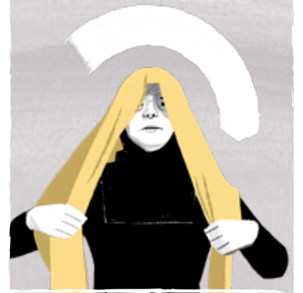
WOMEN AND MEN DO NOT SHARE EQUAL RIGHTS UNDER THE LAW WITH REGARDS TO DIVORCE AND CUSTODY OF CHILDREN.