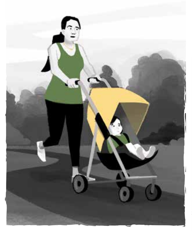
"YOU GO BACK IN THERE, AND YOU'RE, LIKE, IN JAIL AGAIN."