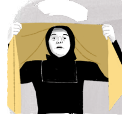
MARRIED WOMEN ARE FORBIDDEN TO LEAVE THE COUNTRY WITHOUT THEIR HUSBANDS' PERMISSION.

Gender discrimination in Iran extends far beyond the compulsory hijab.