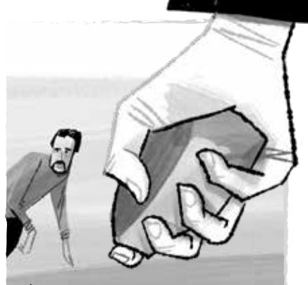
A SMALL NUMBER OF CASES HAVE OCCURRED SINCE THEN, BUT IRANIAN AUTHORITIES CONTINUE TO TREAT WOMEN AS SECOND-CLASS CITIZENS.

FAILURE TO WEAR A HIJAB OR WEAR A HIJAB PROPERLY CAN RESULT IN AN ARREST, A FINE, PRISON SENTENCE OR FLOGGING.