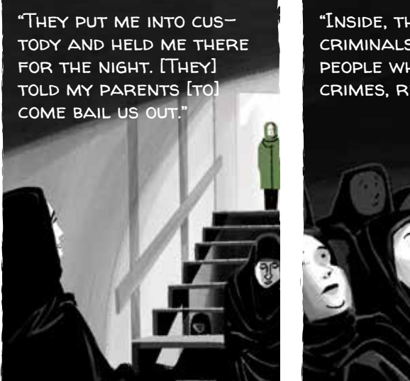
"Inside, there were criminals. There were people who committed crimes, real crimes."