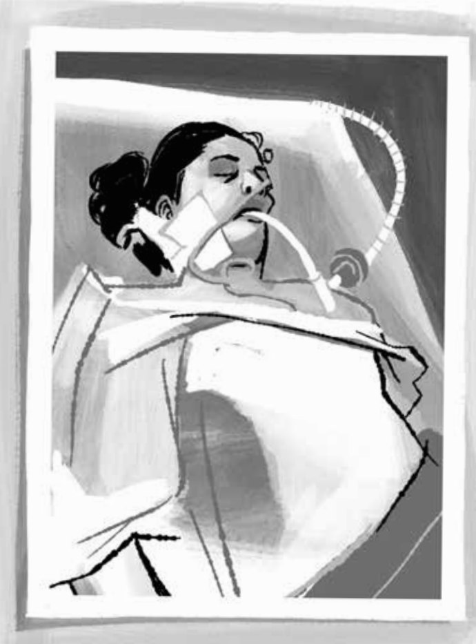
SHE WAS TAKEN INTO CUSTODY ON SEPTEMBER 13 FOR "INAPPROPRIATE ATTIRE" AND DIED THREE DAYS LATER AFTER FALLING INTO A COMA.

HER DEATH SPARKED THE LARGEST PROTESTS IRAN HAS SEEN IN DECADES, WITH WOMEN REMOVING THEIR HIJABS AND CUTTING THEIR HAIR IN DEFIANCE.