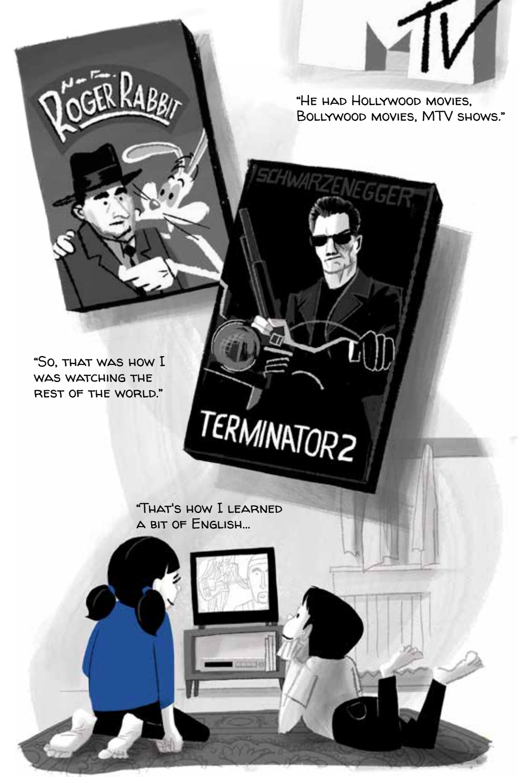
.. And how I learned about many things that I could not say in society."

"AND WE WOULD HAVE THREE MOVIES FOR THE WEEK. AND THEN NEXT WEEK, HE WOULD GIVE US THREE NEW ONES."