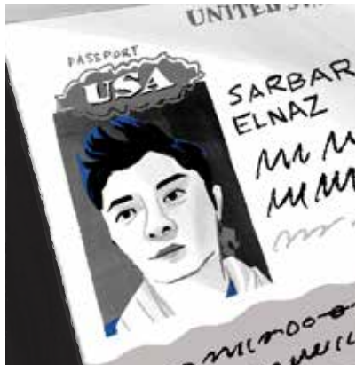
"I SAW HIM THROUGH THE REFLECTION OF THE SHOP DOOR."