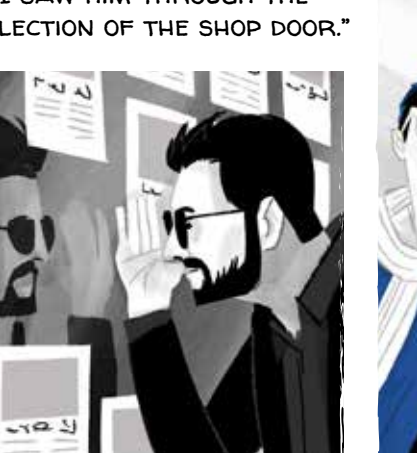
"AND THEN HE TURNED BACK, AND HE LEFT. I WAS REALLY SCARED."