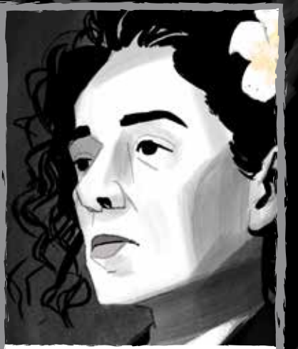
"He lived very close to one of the military bases, which I was not thinking about at the time."

The movement gained significant attention, with many women posting on social media pictures and videos of themselves without the hijab.