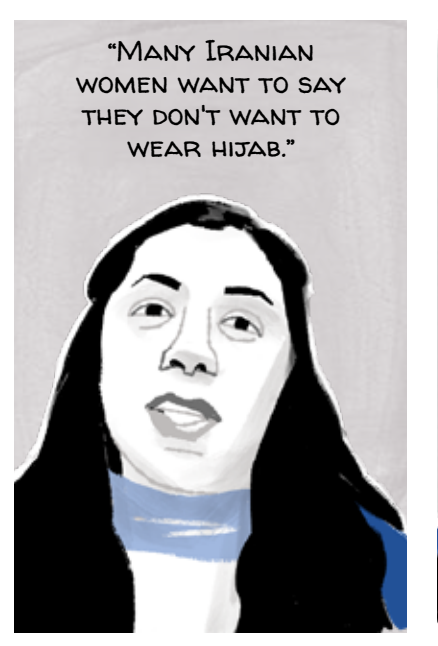
"SO, YOU HAVE THIS CRY STUCK IN YOUR THROAT ... FOR 40 YEARS, IN MY CASE."