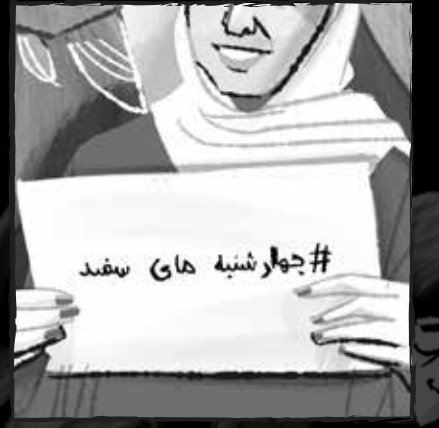
By wearing white on Wednesdays, participants show solidarity with the women in Iran who are calling for greater personal freedom.

The movement gained significant attention, with many women posting on social media pictures and videos of themselves without the hijab.