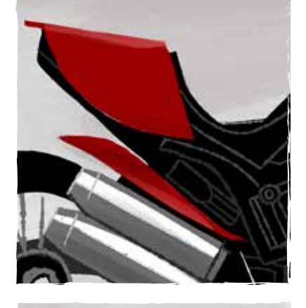
"LUCKILY, IT WAS A ONE-WAY STREET, SO HE HAD TO TURN ONTO A DIFFERENT STREET."

"I HAVE A MOTORCYCLE. I LIKE MOTORCYCLES. CUTE!"